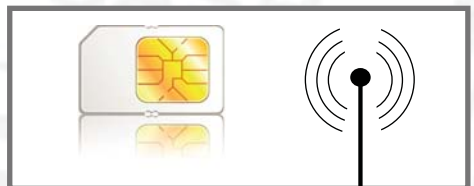
GSM / GPRS (OPTION)

Asia headquarters: CHD ASIA PTE. LTD., 3791 Jalan Bukit Merah #03-05, e-Centre, Singapore, 159471