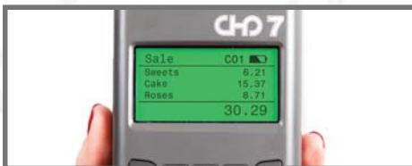
GRAPHIC LCD DISPLAY