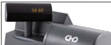
CLEAR LED CUSTOMER DISPLAY