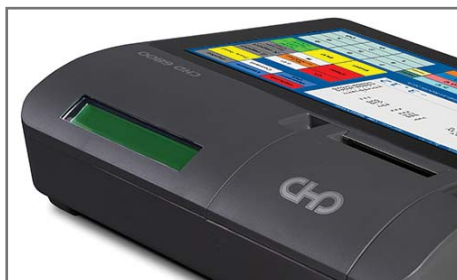
CUSTOMER DISPLAY, 240 x 48 dot